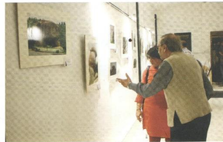
Appreciating the photographs on display